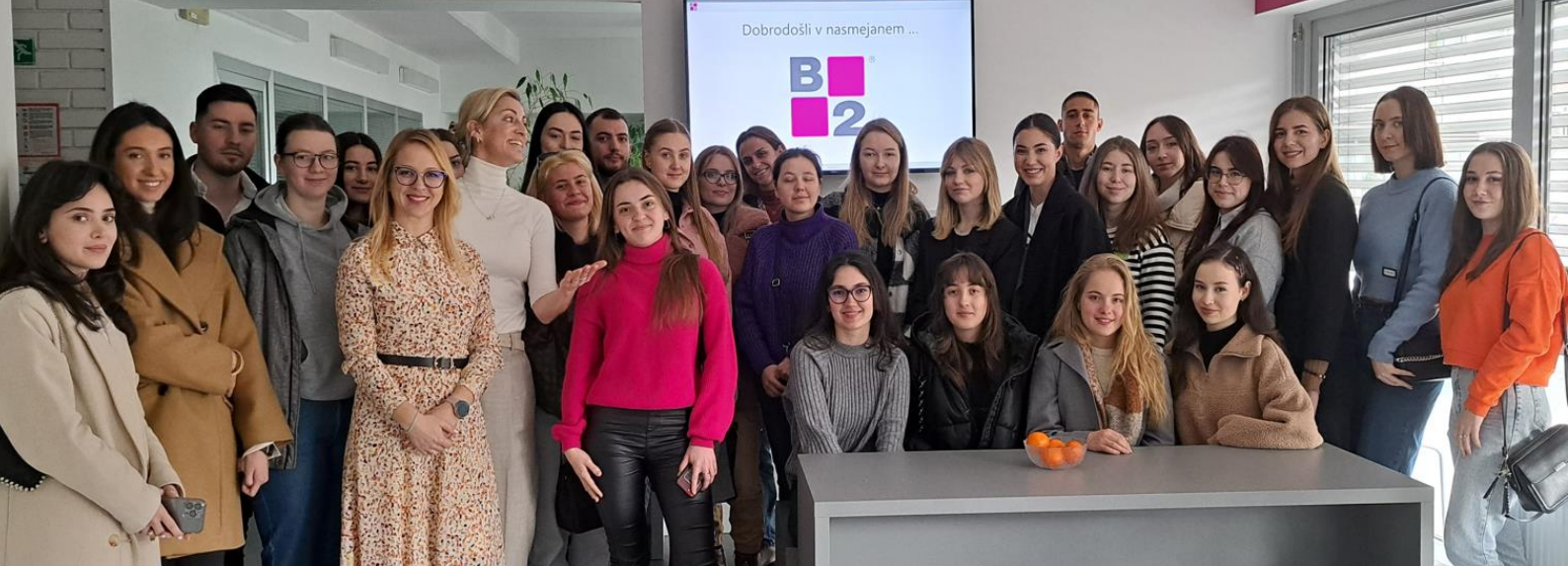
Erasmus Spring generation 2023.